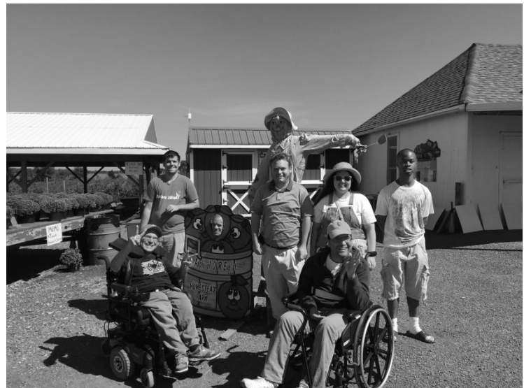
Apple picking at Homestead Farms!