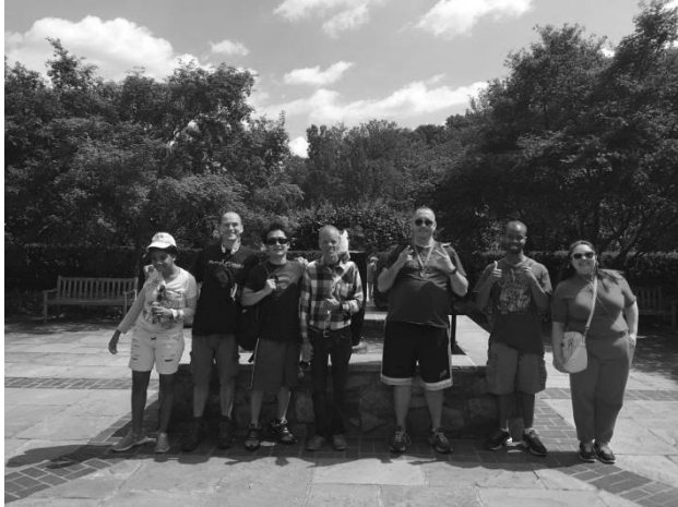
Relaxing at Brookside Gardens!

This movie stunk. Amy Schumer played herself. Most of the movie was raunchy and funny to grown-ups, yet not good for everyone. I wouldn't bring my future kids to watch this flick.