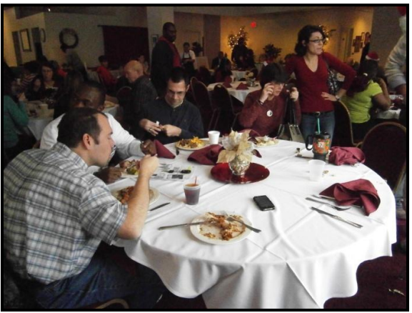
At the Holiday Party -- enjoying lunch