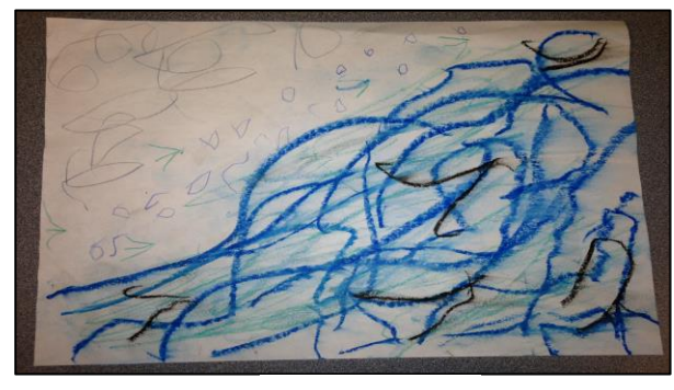
By Trish D