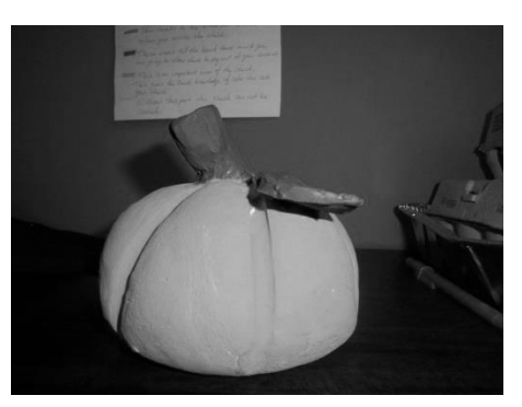
A pottery masterpiece made by Trish D

It came out looking like it was in need of some paint! I painted it orange with a green stem. I'm ready for Halloween, are you?