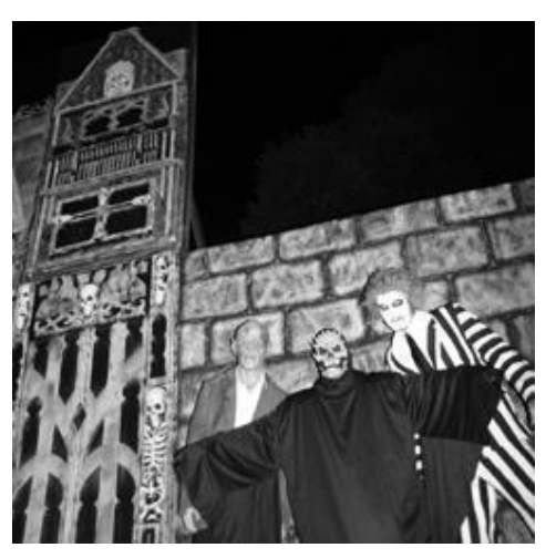
Field of Screams