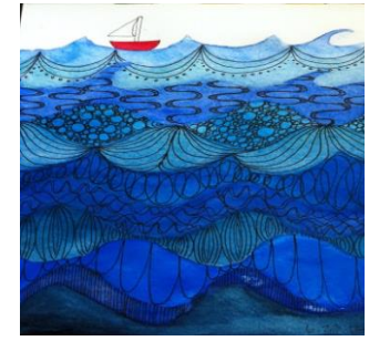
"Art washes away from the soul the dust of everyday life" -Pablo Picasso

"Under the Sea"- The participants of Creative Expression Group were shown a painting by a professional artist posted on her blog "Emilee paints". They were encouraged to think about the ways she captured such a wonderful expression of movement. This brought them to see the connection between lines, patterns, colors, shades and the movement of the sea waves. Later clients were asked to draw their own vision of the sea with attention being paid to their choices of varying shades of the same colors and lines to best reflect the sea character (calm, stormy, mysterious...). These are the results of their explorations.