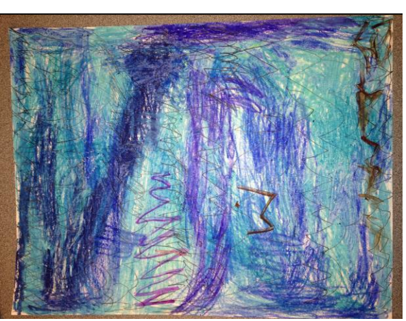
By Desmond O