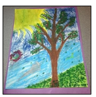
"Time to fish"