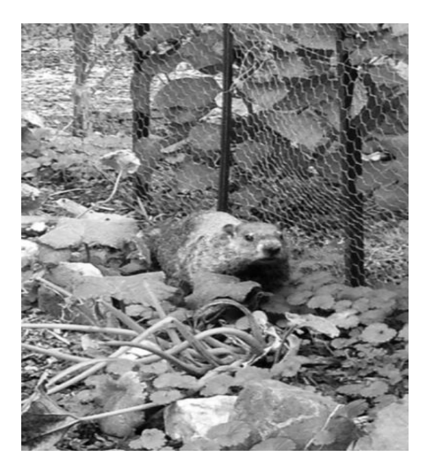
Our friend at the garden!

Let's go back to the garden, my friends. Everything is going just great, the veggies are doing okay. However, we have a little friend that used to come to visit us at our plot every once in a while. Well, it seems like he or she is coming a bit more than we thought, because the last time we were at the garden, we caught the little beggar right there in the act! Well, being the nice animal lovers that we are, we could not hurt it, so we simply chased it out and asked it not to come back. Well, things are okay now but I can't say that they are great. Our guest ate a lot of our produce, but that is alright because we still have a lot left. We shall prevail!