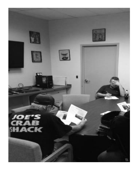
Circulator staffers hard at work

Page 1 Letter from Circulator Staff Page 2 What's New at HIRRS Page 3 Who's Who at HIRRS Page 4 Creative Expression Page 5 Creative Expression Page 6 Summer Activities Page 7 Outings Recap Page 8 Creative Writing Page 9 Creative Writing Page 10 Extra! Extra! Read All About It!