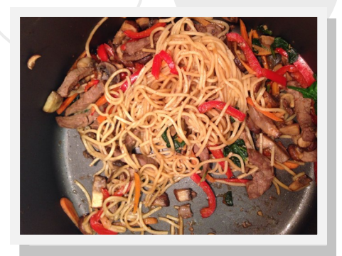
Above: The tasty Lo Mein from Cooking Group!

Creating a relaxing environment through yoga, meditation and breathing exercises is the purpose of this group. Clients channel their imagination and go to their own paradise! They also learn about different areas of wellness.